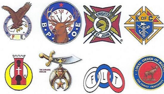
Eagles, elks, knights of St. John, knights of Columbus, Shriners, Alhambra, odd fellows, and the Moose